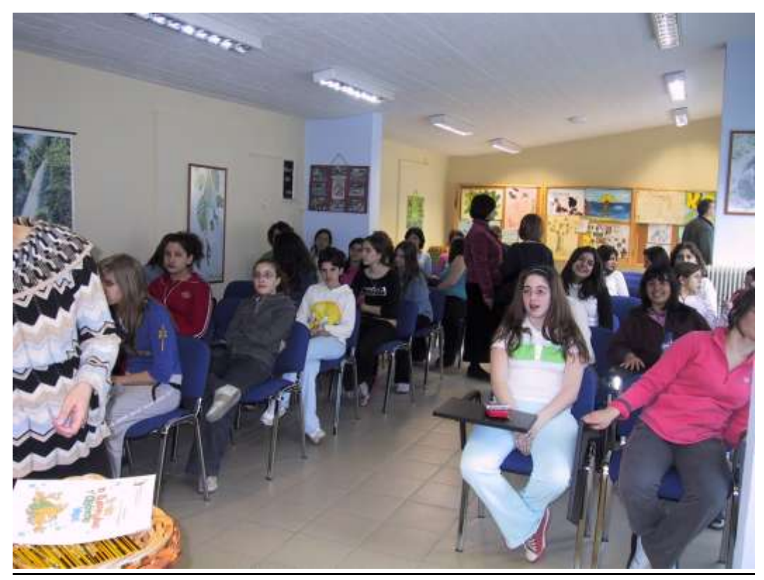
Welcome session in the Centre