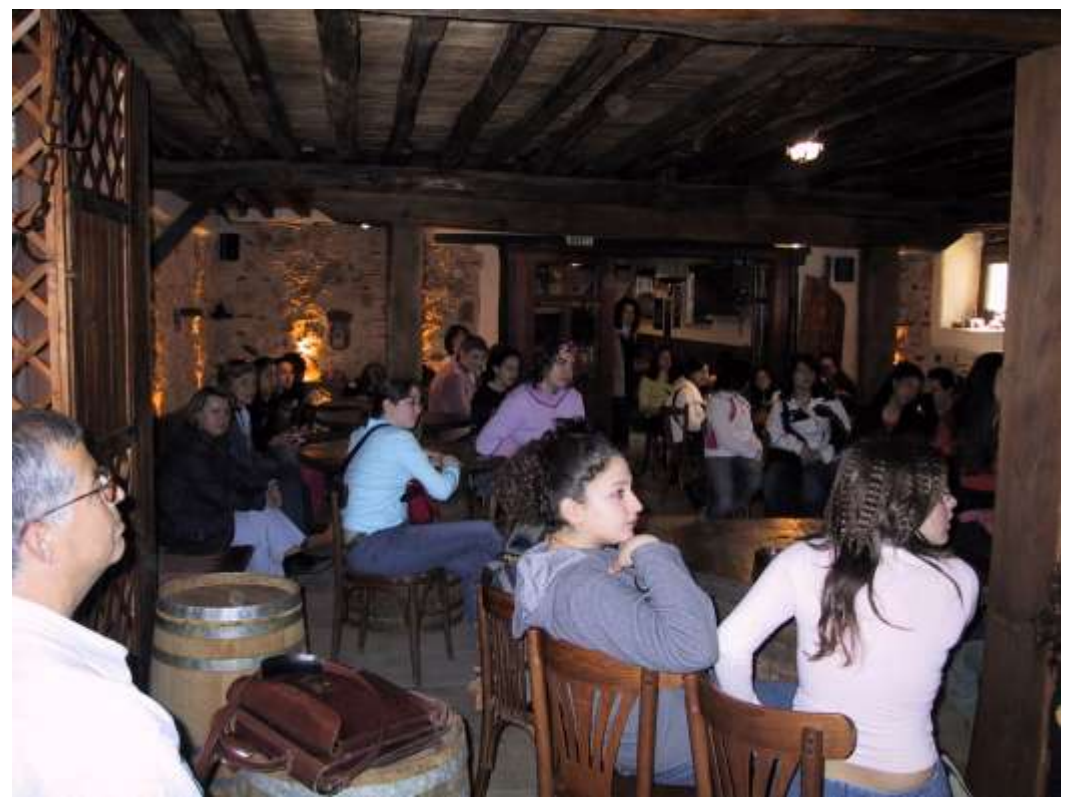
In the winery